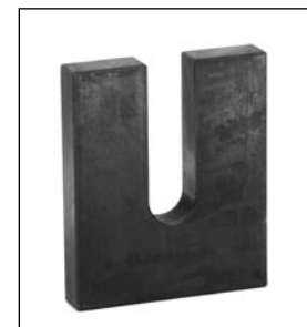
Fig. S115 — EO-Karrymat Back-up Plates for Ferulok

Dimensions and pressures for reference only, subject to change.