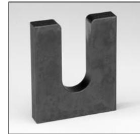
Fig. S113 — GHP Nut Die

* Nut Dies for 6-12mm are identical in LL, L and S series.